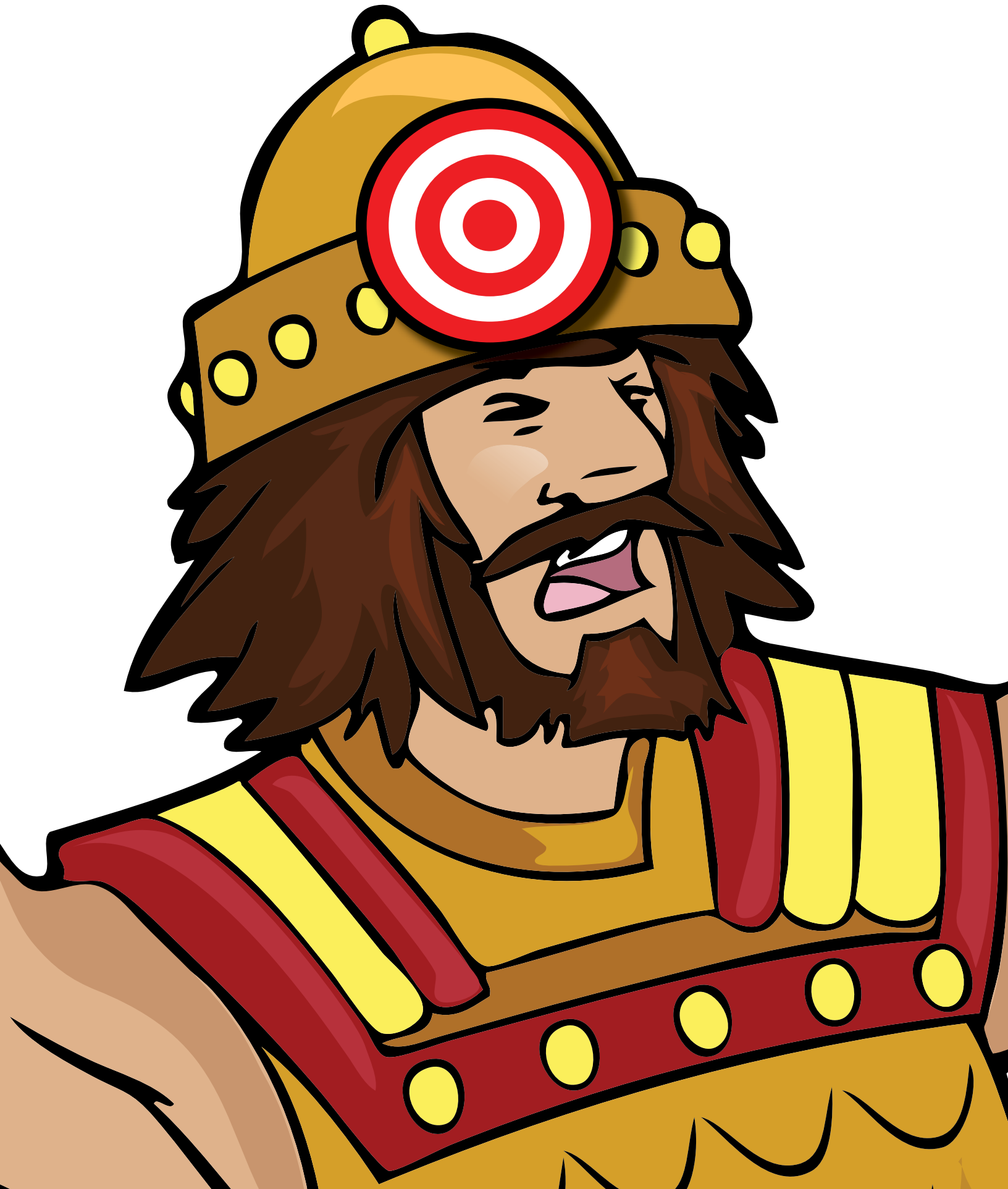
Goliath Head (for game pin) Unit 5: Bear Hug 21 Cubbies AppleSeed Teaching Plans Resource CD