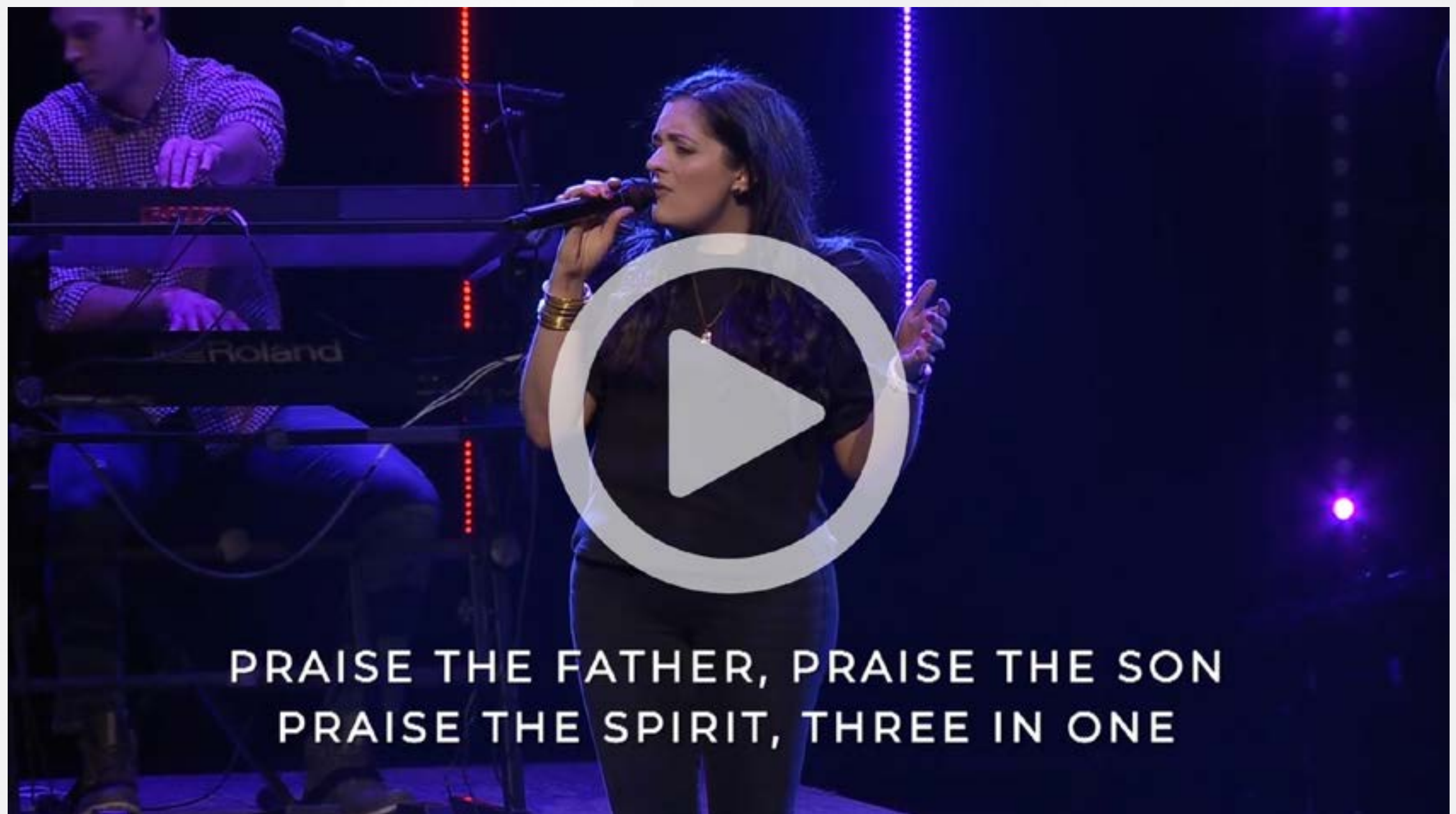
King of Kings