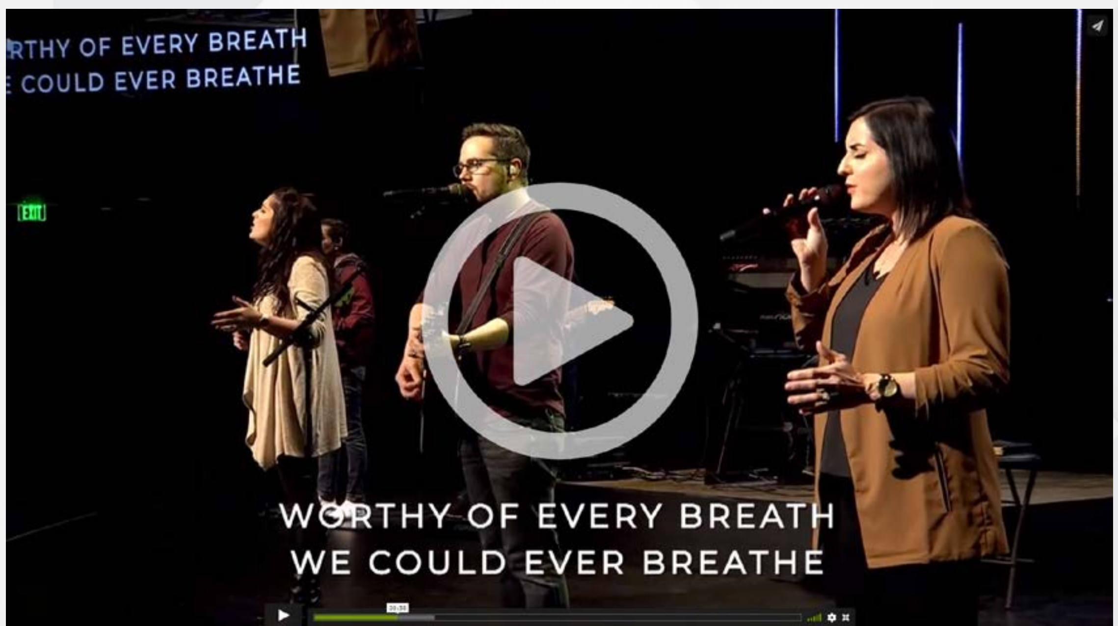
Build My Life