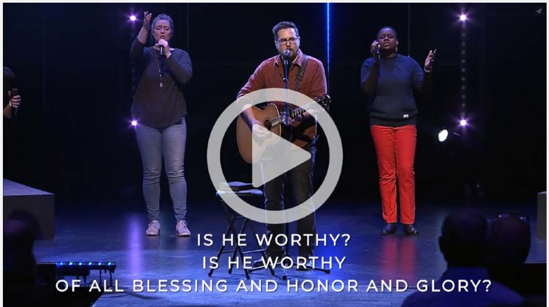
Is He Worthy